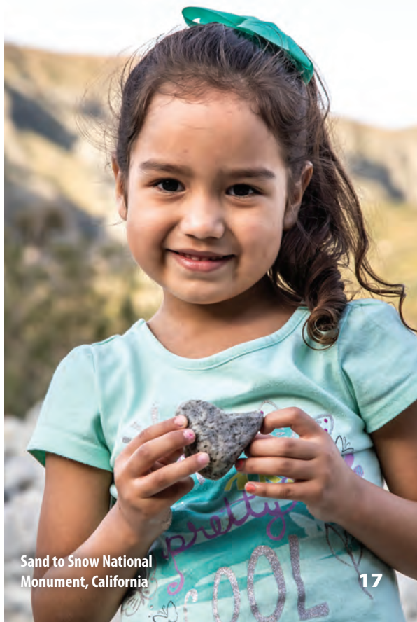
Sand to Snow National Monument, California